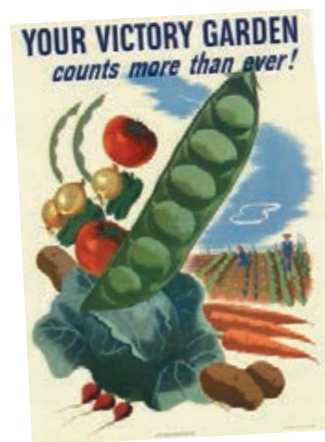
In 1944, 19 million Americans had "victory gardens."

Small-space gardening takes many forms: container gardening, vertical gardening, raised beds, and community gardens, to name only a few. What all of them have