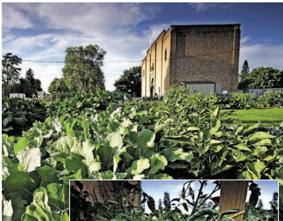
Spokane's East Central Community Garden